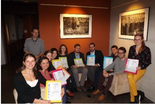
Havel graduates receive their certificates (2018)

Promoting the interests in the European Parliament: case study of the Passenger Name Record directive