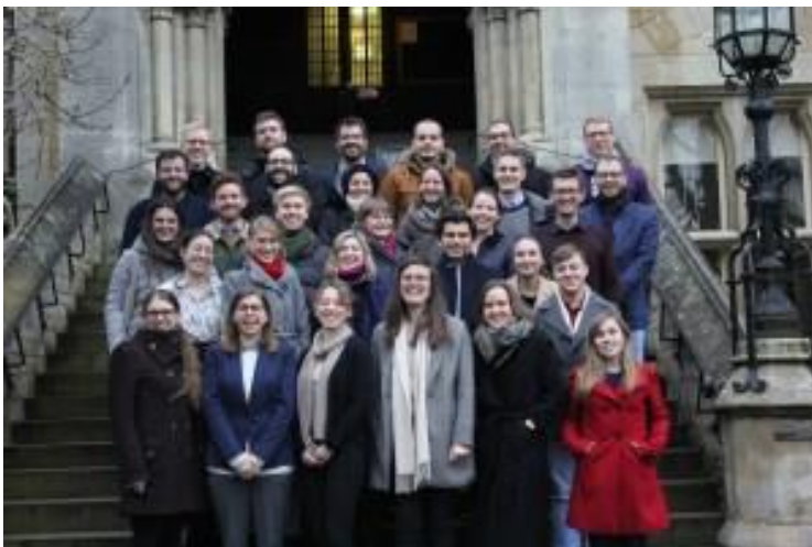
The first Europaeum Scholars cohort, in Balliol College, January 2018

The Europaeum Scholars Programme (launched in 2018) was conceived to bring together the values and vision of the Europaeum, with a focus on themes such as inclusion, sustainability, and growth and development. It is a world-class doctoral training programme that is taken alongside an existing doctorate, designed for those exceptional students who have the capacity and the desire to shape the future of Europe for the better. It runs for two years alongside Scholars' existing doctoral studies and is multi-disciplinary, multi-university, and multi-locational and focused on contemporary European policy. Teaching is primarily in small groups of seven or eight, working intensively as teams and being critically tested by academics affiliated with the Europaeum. There are also be lectures and seminars lead by external experts, leading thinkers, media experts and business people, and policy-makers. Scholars tackle the moral and ethical considerations involved in policy as well as an examination of the qualities that they themselves bring to the table.