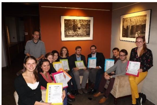
Havel graduates receive their certificates (2018)

The Václav Havel Programme gained its name after the prominent personality of the Czech ex-president Václav Havel. The programme was launched in the academic year of 2012/2013 by a trio of the Europaeum member universities: Leiden University, Université Paris I Panthéon-Sorbonne and Charles University in Prague. It is designed as a complementary two-year programme for Masters' students of the three partner universities who focus their studies on European issues. The Václav Havel Scholars enjoy not only a one-semester exchange at one of the partner universities of the programme, but they also participate in the Oxford Spring School where they can meet with students from other member universities of the Europaeum association or students involved in other Europaeum programmes, such as History & Civilisation or European Politics & Society .